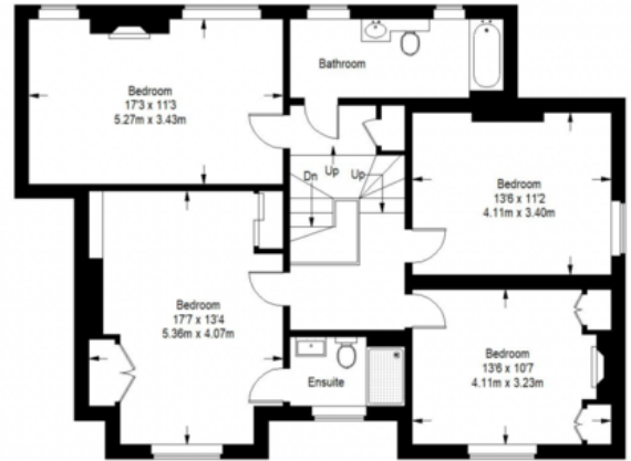
First Floor = 1009 sq ft