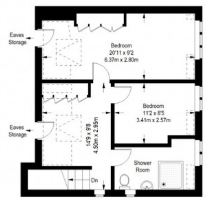
Second Floor = 526 sq ft

Approximate Gross Internal Area FIRST FLOOR = 661 sq ft / 61.41 sq m SECOND FLOOR = 526 sq ft / 48.87 sq m Total = 1187 sq ft / 110.27 sq m