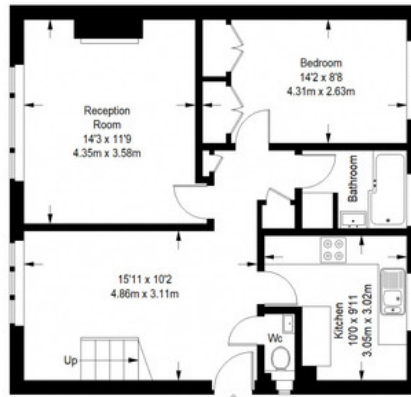
First Floor = 661 sq ft